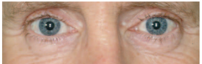
Figure 2. Top: pretreatment, bottom: post-treatment.