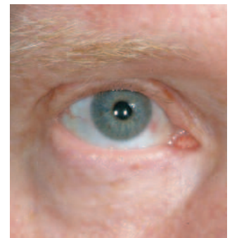
Figure 4. Right eye pretreatment and post-treatment.

Treatment parameters are subject to change—please consult your sales representative or clinical consultant, or visit www.mycandela.com to obtain current information regarding the use of your Candela device.