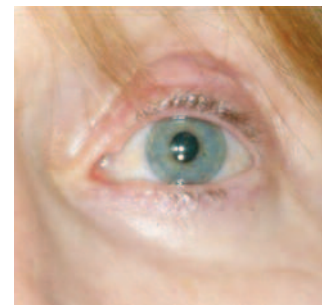
Figure 3. Left eye pretreatment and post-treatment.