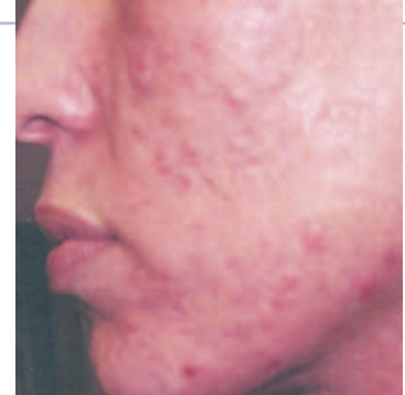
6 mm, 11 J/cm 2 , 250 ms, DCD: 40, 1tx

Acne is a prominent issue for women in their twenties and thirties, which can be exacerbated by stress and hormones as well as their menstrual cycle. This segment of women makes up the majority of the patients whom we treat with Smoothbeam in our cosmetic practice. We have been using Smoothbeam to treat active acne, as well as acne scars, with great success for a year and a half, and we have been extremely pleased with the results. There are numerous advantages to using the Smoothbeam diode laser—one of the most compelling characteristics of this new laser treatment for acne is the low side-effect profile. Our patients may experience a slight redness to the skin, which will subside within a few hours—in addition to this, no downtime exists, and patients are able to return to normal activities immediately following treatment. Another reason that this treatment option is popular is that just three to five treatments are required, and these treatments may be spread out over time, with an interval of about four weeks in between each treatment.