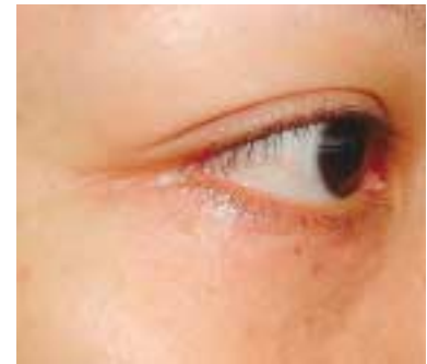
Figure 2—One month after two treatments

Candela Corporation 530 Boston Post Road Wayland, MA 01778, USA Phone: (508) 358-7637 Fax: (508) 358-5569 Toll Free: (800) 821-2013 www.clzr.com