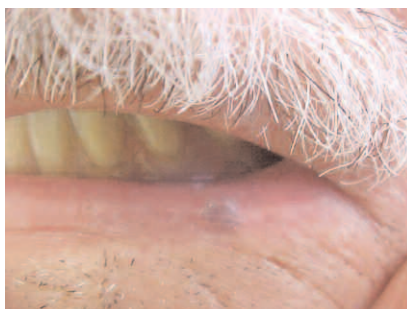
Figure 3—Case 3 Pretreatment.