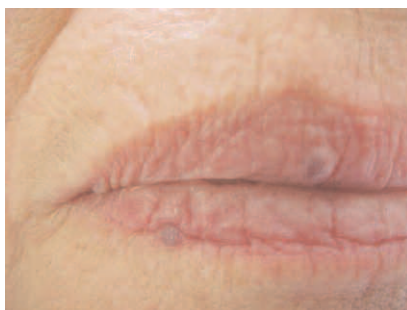
Figure 2—Case 2 Pretreatment.