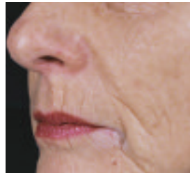
after two treatments