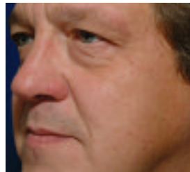
after two treatments

For more information on these therapies, please visit www.candelalaser.com .